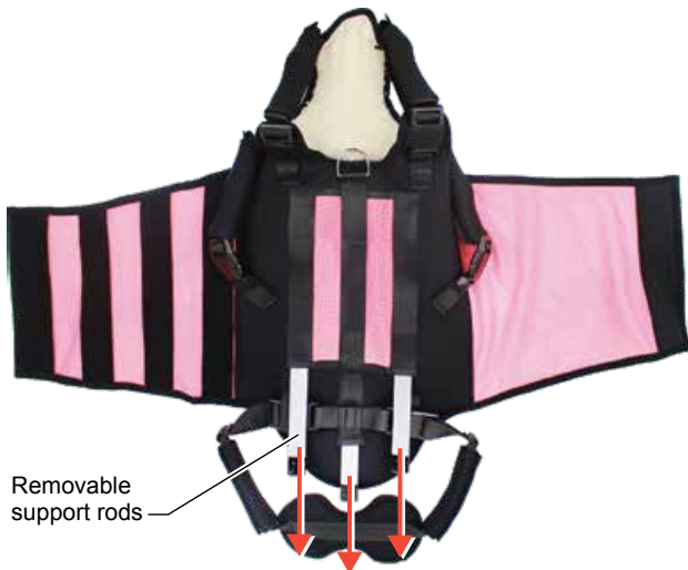
Removable support rods